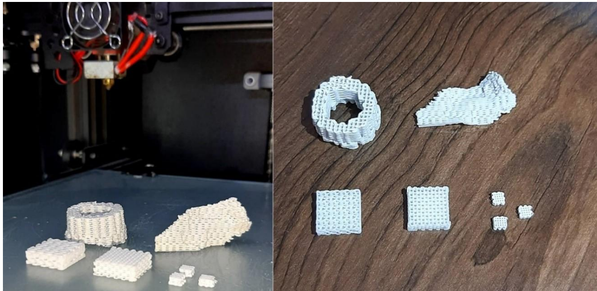
Figure 2. Left: Scaffolds on 3d printing bed at the end of the printing process, Right: Different scaffolds with diverse shape and pores ( Design by Authors, 2024 ).

characterized by varying pore shapes and sizes ( Figure 2 ). Notably, the print times for each scaffold exhibit a significant disparity, spanning from mere minutes to several hours. The scaffolds were tailored to cater to the regeneration needs of various tissues, including bone, cartilage, and skin.